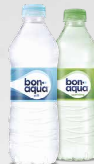
Bonaqua water (Still or sparkling) 500ml €2.00

Enjoy our delicious and fresh summer drinks!