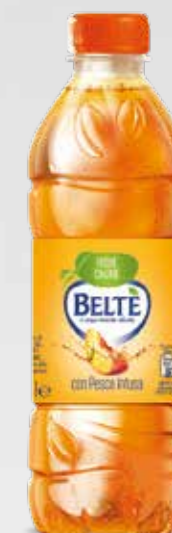
Belte peach ice tea 500ml €3.00