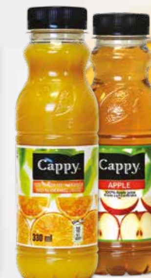
Cappy orange juice or apple juice 330ml €2.50

The high decibel level in the cabin interferes with how we perceive flavour and the taste known as umami is heightened.