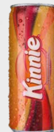
Kinnie 330ml €2.50