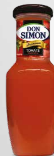
Don Simon tomato juice 200ml €2.50