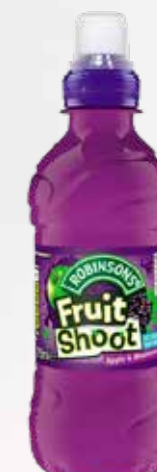
Robinsons Fruit Shoot apple & blackcurrant 200ml €2.00