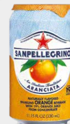
San Pellegrino Aranciata 330ml €3.00