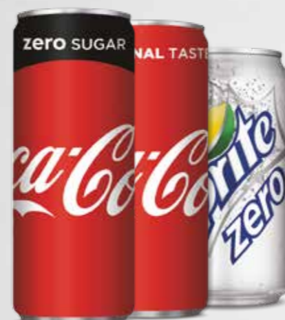
Coca Cola, Coca Cola Zero or Sprite Zero 330ml €2.50